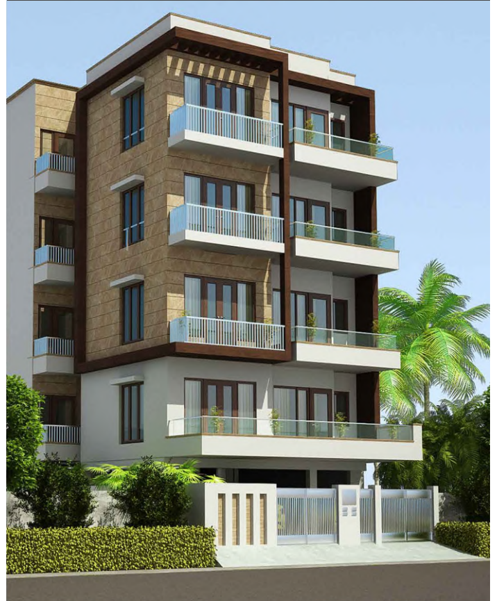
K-1995, CHITTARANJAN PARK