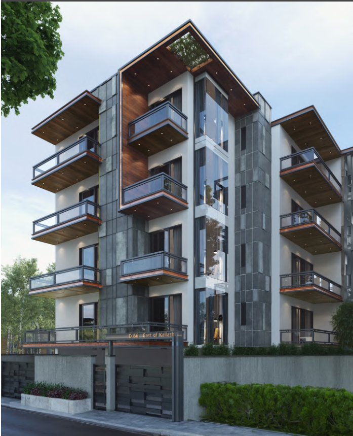
D-66 EAST OF KAILASH