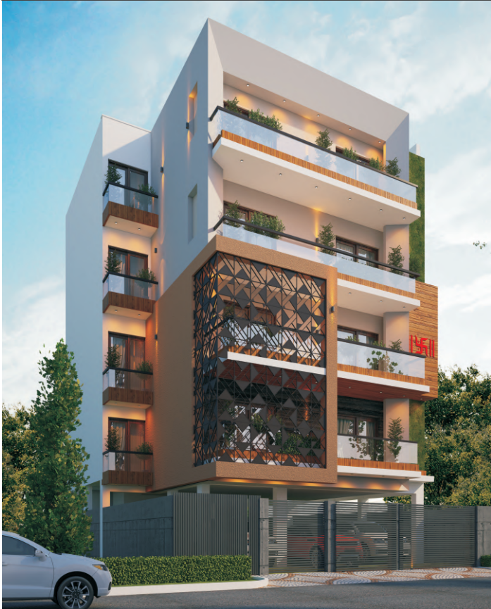
J-1835, CHITTARANJAN PARK